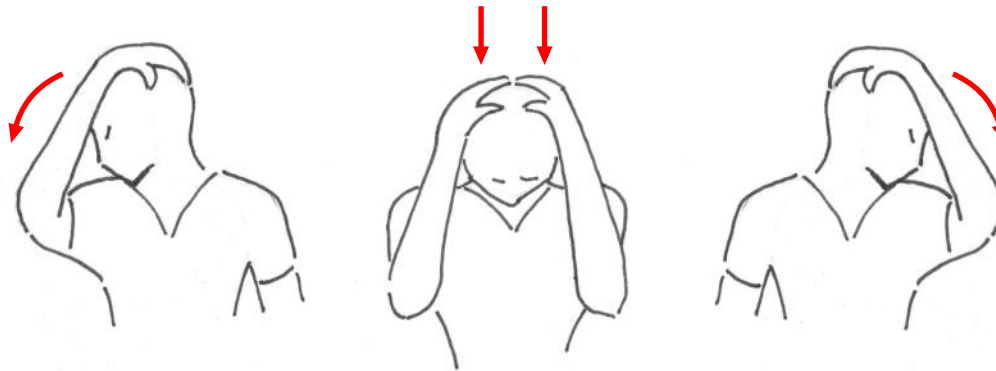
Chin to right armpit

Head Pull Down: 2 x 15 seconds in each position